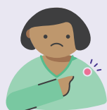
Arm is sore or red at the injection site

Side effects are common. Here's what to look out for.